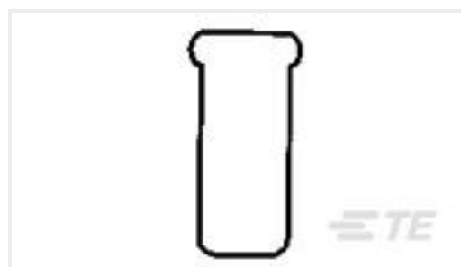
TE Part #328308 SPARE WIRE CAP,BLU, 16-14 AWG