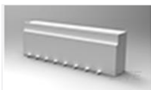
TE Part #84982-4 1MM FFC SMT V ASSY 4P EMBOSS