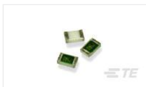
TE Part #9-1879208-9 CPF0402 150K 0.1% 25PPM 5K RL