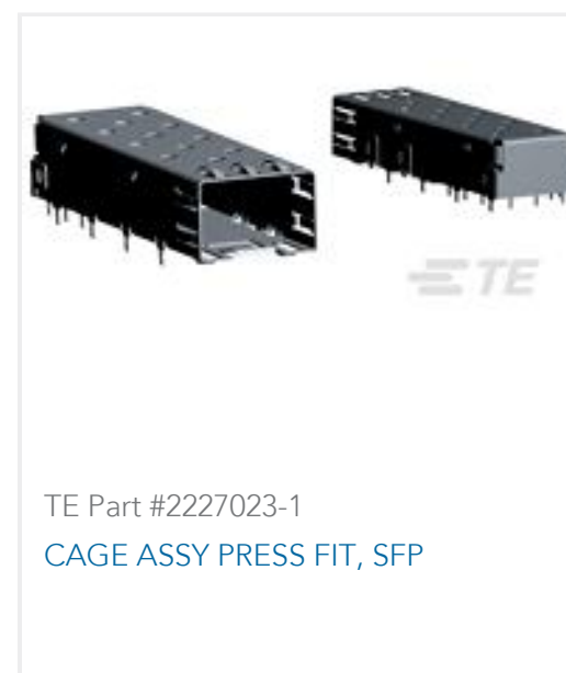
TE Part #2227023-1 CAGE ASSY PRESS FIT, SFP