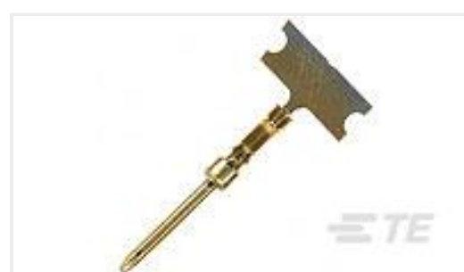
TE Part #745254-7 20 DF PIN CONT L.P.