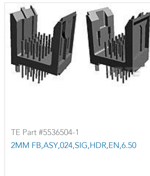
TE Part #5536504-1 2MM FB,ASY,024,SIG,HDR,EN,6.50