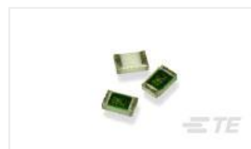
TE Part #1-1879214-6 CPF 0402 464R 0.1% 25PPM 1K RL