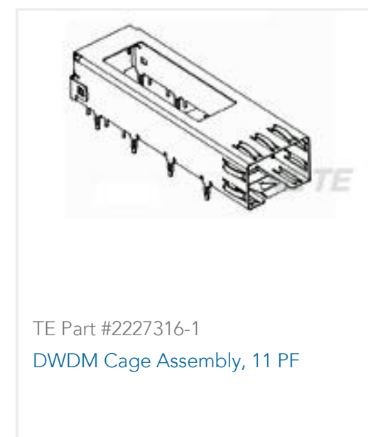
TE Part #2227316-1 DWDM Cage Assembly, 11 PF