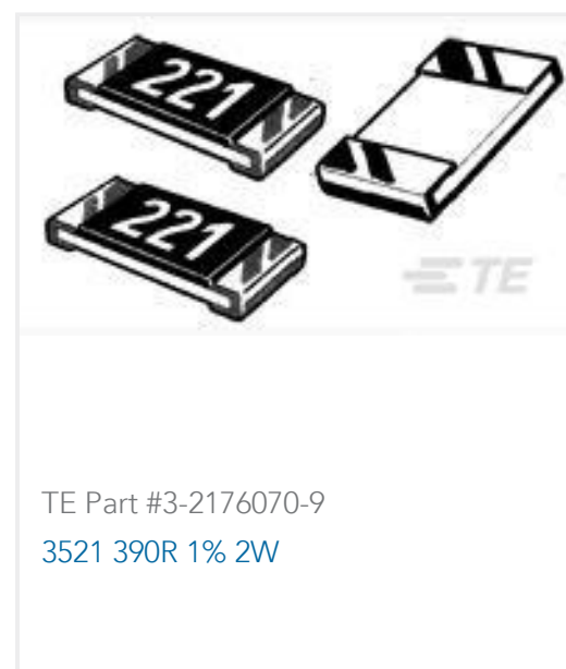
TE Part #3-2176070-9 3521 390R 1% 2W