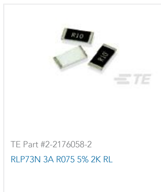
TE Part #2-2176058-2 RLP73N 3A R075 5% 2K RL