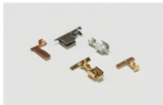
Special Purpose Terminals(1)