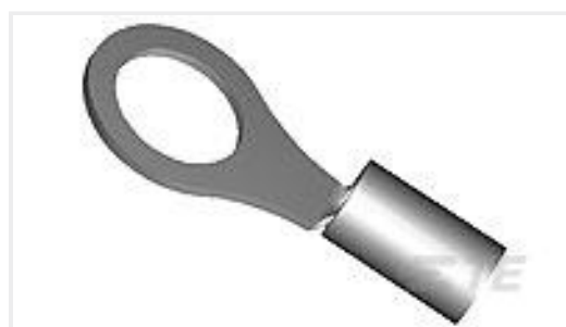
TE Part #324054 TERMINAL,T-N R 2 3/8