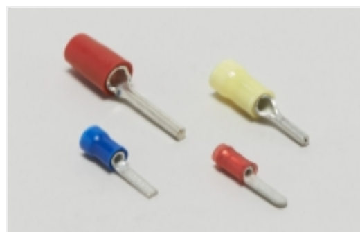
Crimp Wire Pins, Tabs & Ferrules(41)