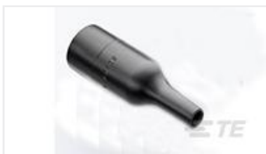
TE Part #CV7373-000 202K153-25L-0