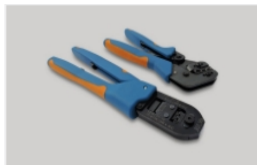
Hand Crimping Tools(2)