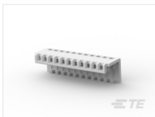
TE Part # CAT-104MTA-NYLCC Nylon PCB Connector Covers: 2.54 mm, MTA 100