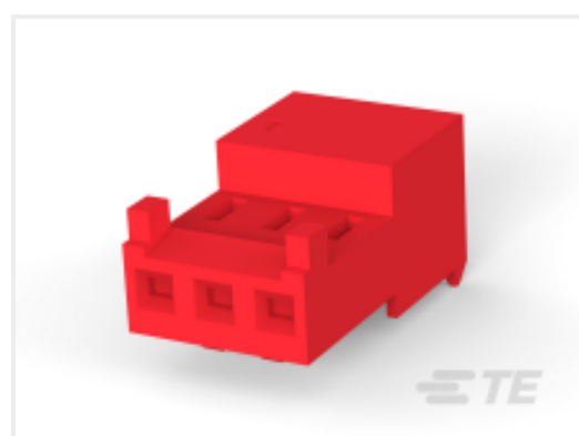
TE Part # CAT-104MTA-NTPMR Nylon Tin Plated Receptacle: 2.54 mm, with Mating Alignment, MTA 100