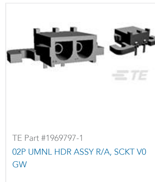
TE Part #1969797-1 02P UMNL HDR ASSY R/A, SCKT V0 GW