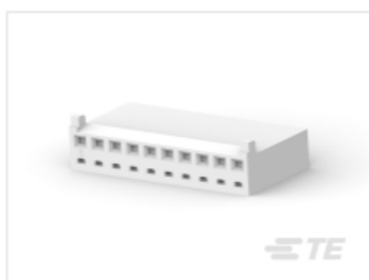
TE Part # 1-1375820-0 CST-100 II HOUSING 10 POS