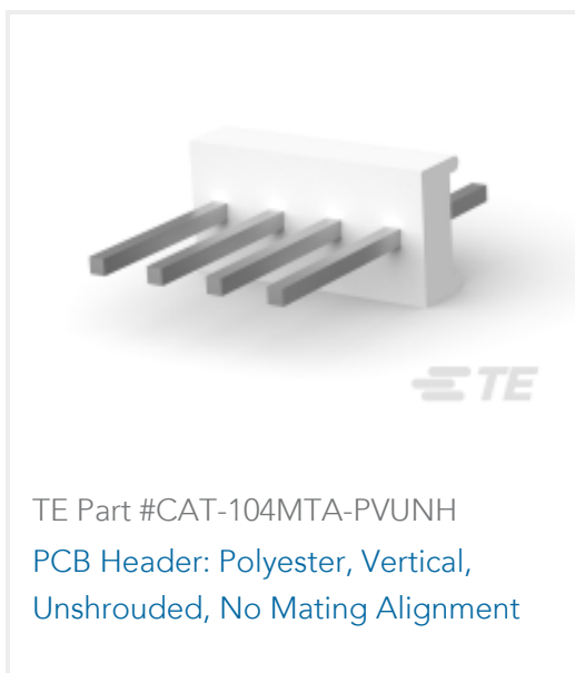
TE Part #CAT-104MTA-PVUNH PCB Header: Polyester, Vertical, Unshrouded, No Mating Alignment