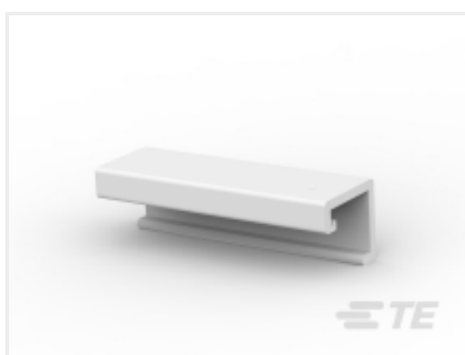
TE Part # CAT-104MTA-PLSCC Polyester PCB Connector Covers: 2.54 mm, MTA 100