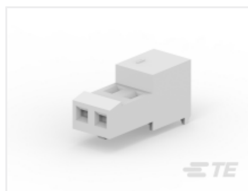
TE Part # CAT-104MTA-NTPNR MTA Receptacle: Nylon, Tin Plated, 2.54 mm