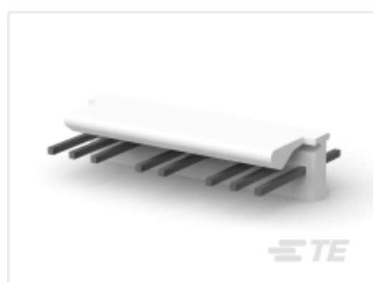
TE Part # 643879-6 10P MTA100 HDR ASSY F/L W/O4&7