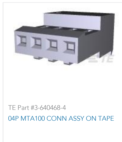
TE Part #3-640468-4 04P MTA100 CONN ASSY ON TAPE