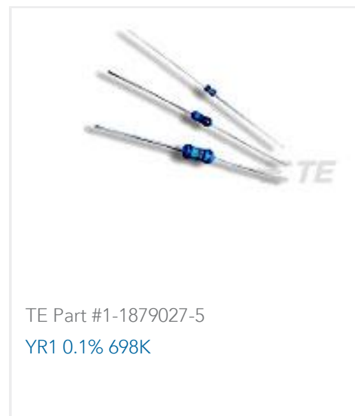
TE Part #1-1879027-5 YR1 0.1% 698K