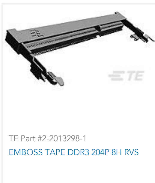
TE Part #2-2013298-1 EMBOSS TAPE DDR3 204P 8H RVS