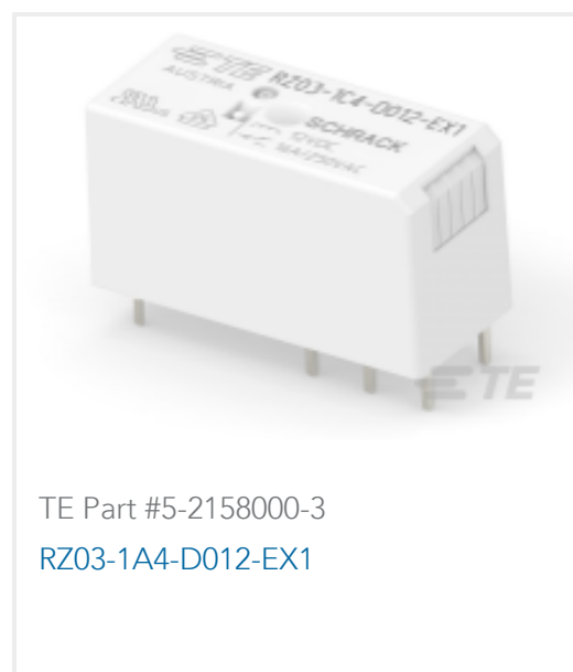
TE Part #5-2158000-3 RZ03-1A4-D012-EX1