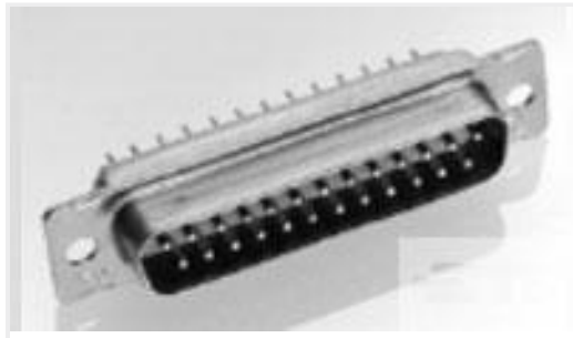
TE Part #1757827-5 AMPLIMITE,PLUG ASY,POSTD,109,ZN, 5