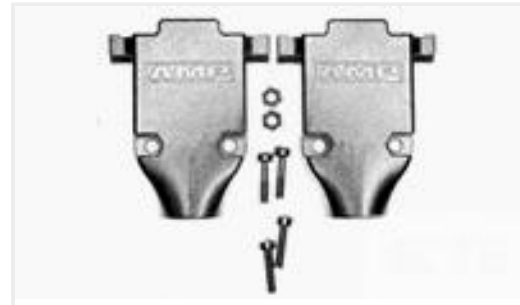
TE Part #5745174-5 CABLE CLAMP KIT,SZ 4