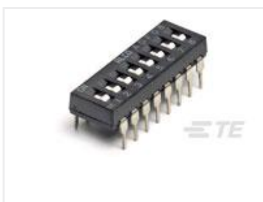
TE Part #1-1825059-3 ADF04S04=DIP SWT,FLUSH,SMT-GW