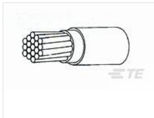
TE Part #2820303009 44A0111-22-0