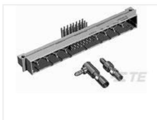
TE Part #5148414-5 ASSY,PIN,R.A.,TYPE M,EUROCARD,L-FREE,24+