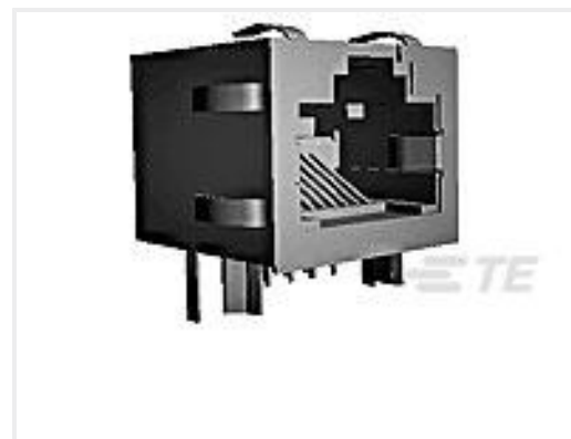
TE Part #1-406541-1 MJ,INV,1X1,6PNL G.,100"ST,SN