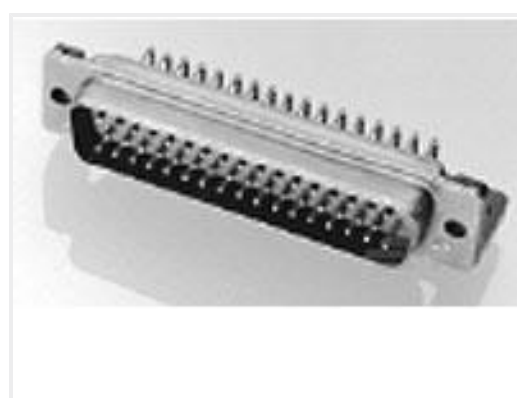
TE Part #1218408-3 AMPLIMITE,ASY,RCPT,RTANG,109,3