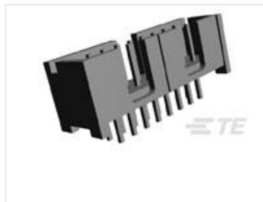
TE Part #103308-1 010 LOPRO HDR SP 15DP