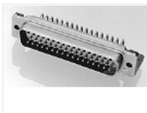
TE Part #1218408-1 AMPLIMITE,ASY,RCPT,RTANG,109,1