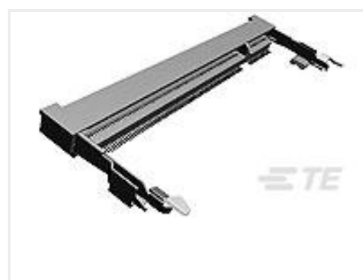
TE Part #1717254-1 EMBOSS ASS'Y DDR SODIMM SOCKET