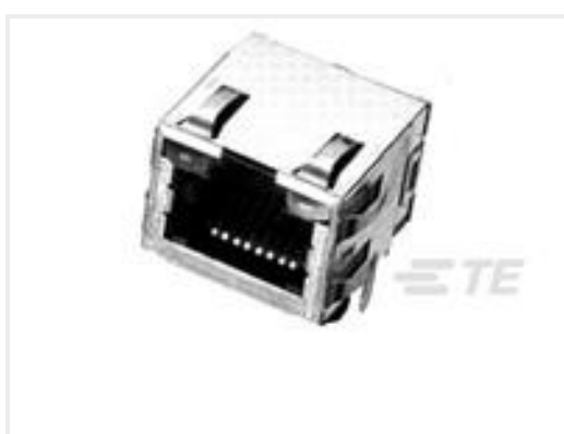
TE Part #2-406549-4 IMJ,1X1,PNL GRD,LED(Y/G), S