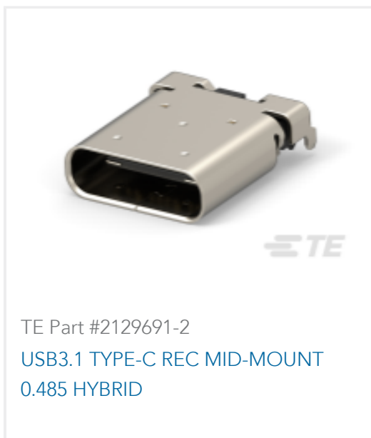
TE Part #2129691-2 USB3.1 TYPE-C REC MID-MOUNT 0.485 HYBRID