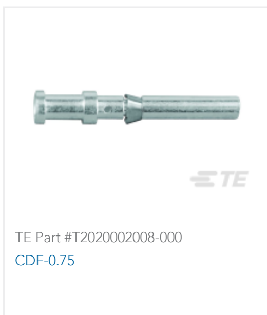
TE Part #T2020002008-000 CDF-0.75