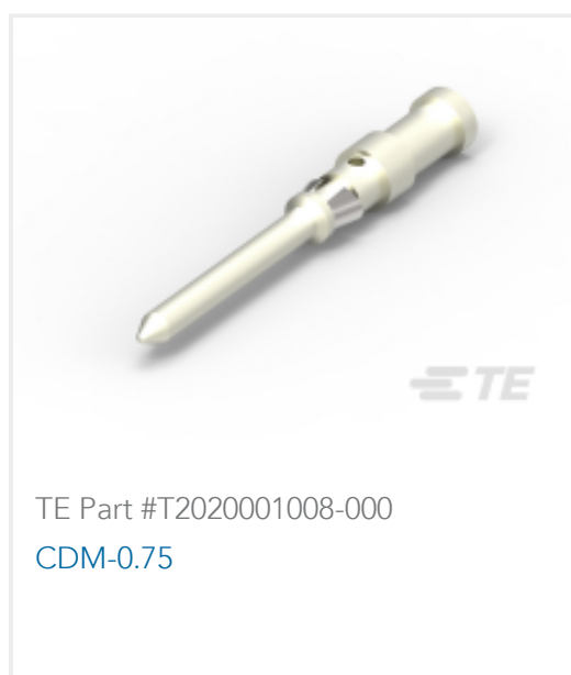
TE Part #T2020001008-000 CDM-0.75