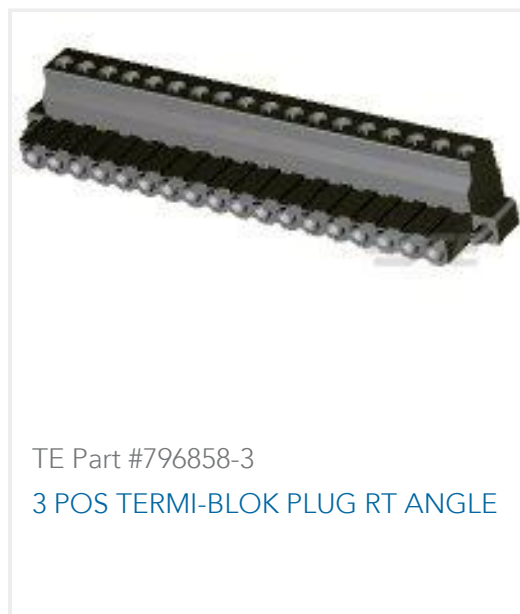
TE Part #796858-3 3 POS TERMI-BLOK PLUG RT ANGLE