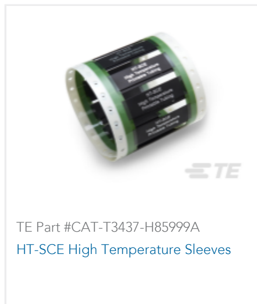
TE Part #CAT-T3437-H85999A HT-SCE High Temperature Sleeves