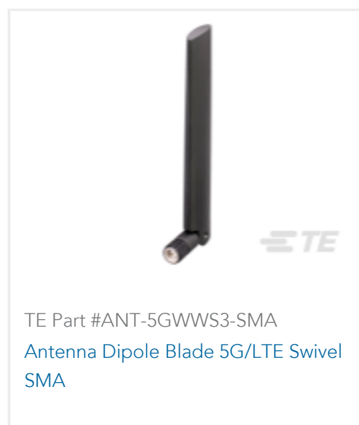
TE Part #ANT-5GWWS3-SMA Antenna Dipole Blade 5G/LTE Swivel SMA