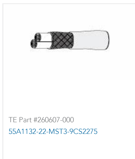
TE Part #260607-000 55A1132-22-MST3-9CS2275