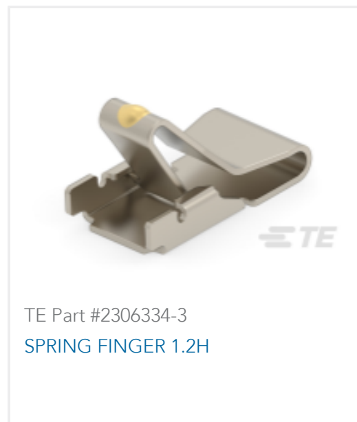
TE Part #2306334-3 SPRING FINGER 1.2H