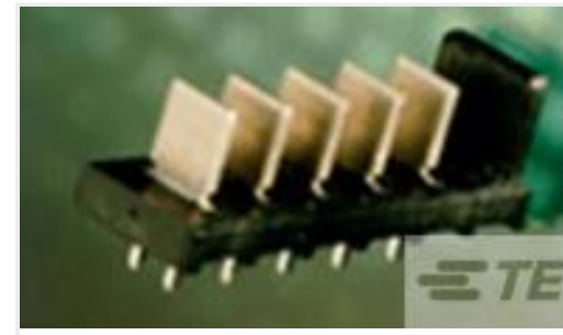
TE Part #5787334-1 HDR ASY,VERT,STR TAIL,7.2V