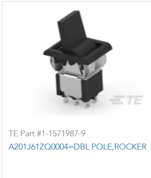
TE Part #1-1571987-9 A201J61ZQ0004=DBL POLE,ROCKER