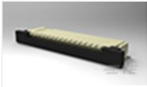
TE Part #1-84953-5 1MM FPC HORZ.TOP CONT.ASSY 15P