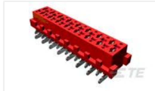
TE Part #7-188275-6 MICRO-MATCH SMD FTE