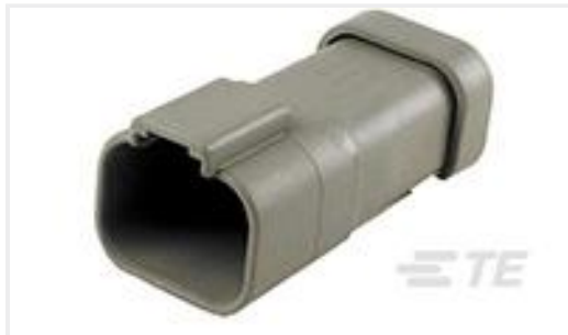
TE Part #DT04-4P-E003 REC, 4P, GRY, N, CAP