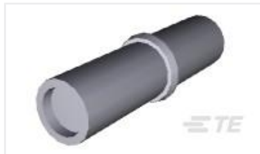
TE Part #1-480349-0 01P CMNL PLUG HSG F/H NATL