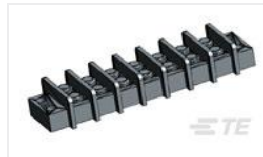
TE Part #1546670-7 7P .437" DR BARRIER,W/BND SCRW