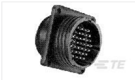
TE Part #206036-1 RECEPT,SZ 17-16 CPC