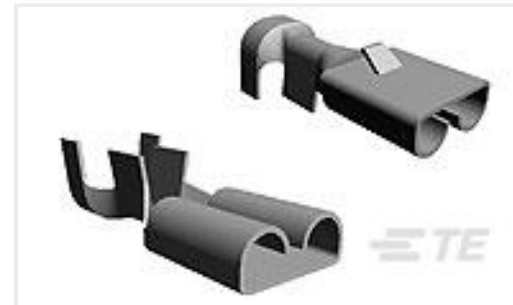
TE Part #160927-4 FF 250 REC 1.0-2.5MM2 TPPB