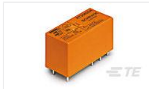
TE Part #3-1393240-5 RT33L024