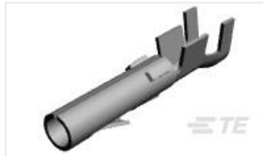
TE Part #60619-1 CMNL SOK PTPBR L/P