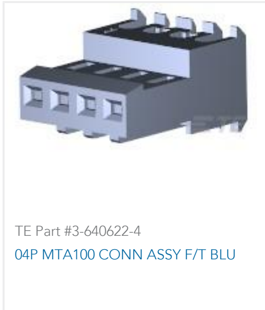
TE Part #3-640622-4 04P MTA100 CONN ASSY F/T BLU