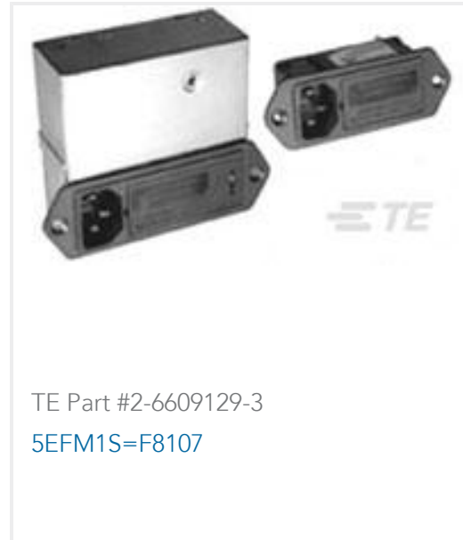
TE Part #2-6609129-3 5EFM1S=F8107