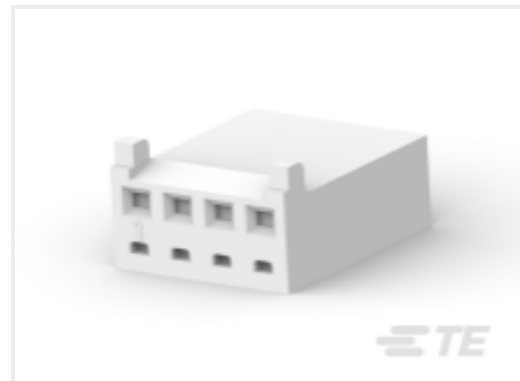
TE Part # 1375820-4 CST-100 II HOUSING 4 POS