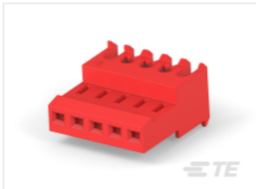
TE Part # CAT-104MTA-NGPNR Nylon Gold Plated Receptacle: 2.54 mm, no Mating Alignment