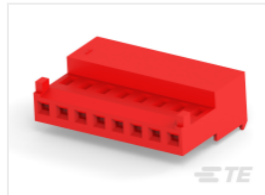
TE Part # CAT-104MTA-NGPMR Nylon Gold Plated Receptacle: 2.54 mm, with Mating Alignment, MTA 100