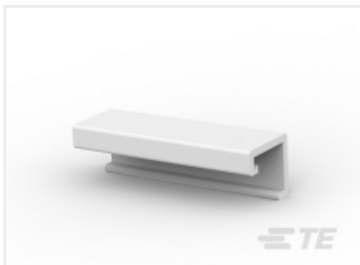
TE Part # CAT-104MTA-PLSCC Polyester PCB Connector Covers: 2.54 mm, MTA 100