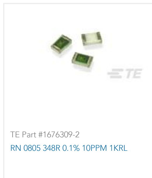
TE Part #1676309-2 RN 0805 348R 0.1% 10PPM 1KRL