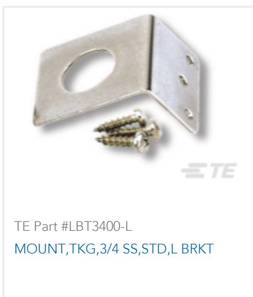
TE Part #LBT3400-L MOUNT,TKG,3/4 SS,STD,L BRKT