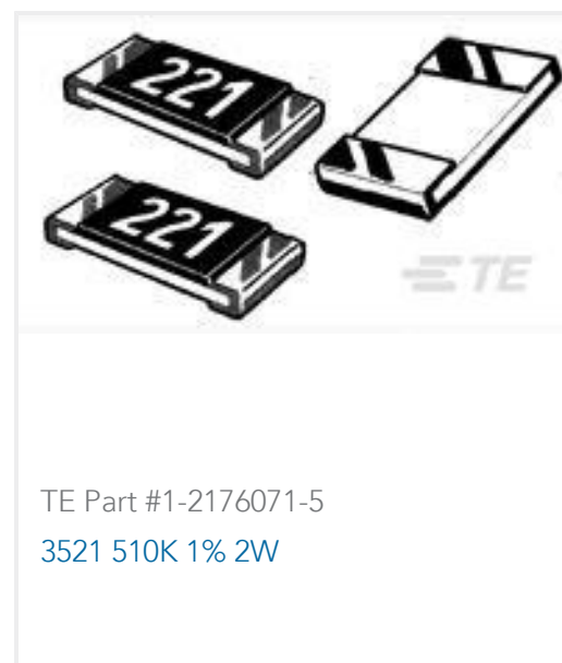
TE Part #1-2176071-5 3521 510K 1% 2W