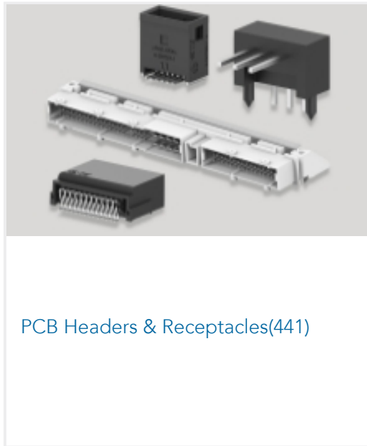
PCB Headers & Receptacles(441)