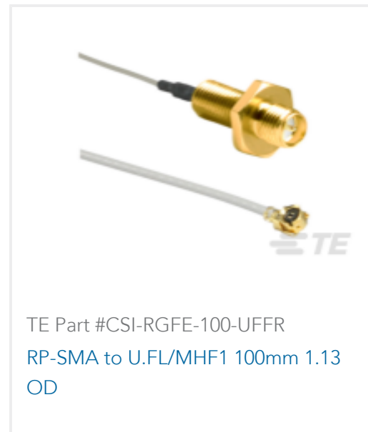
TE Part #CSI-RGFE-100-UFFR RP-SMA to U.FL/MHF1 100mm 1.13 OD