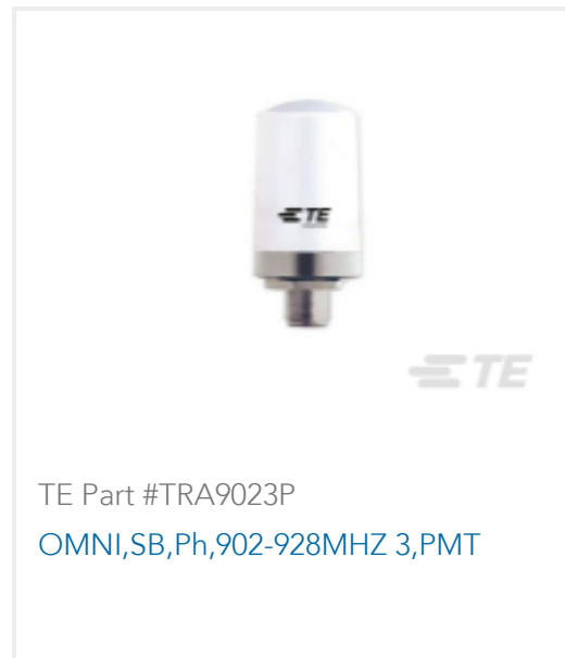
TE Part #TRA9023P OMNI,SB,Ph,902-928MHZ 3,PMT OD