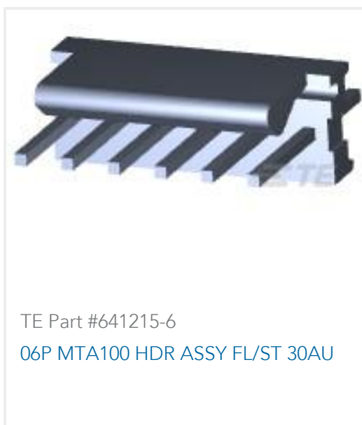
TE Part #641215-6 06P MTA100 HDR ASSY FL/ST 30AU