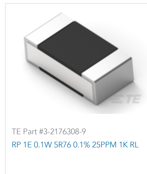
TE Part #3-2176308-9 RP 1E 0.1W 5R76 0.1% 25PPM 1K RL