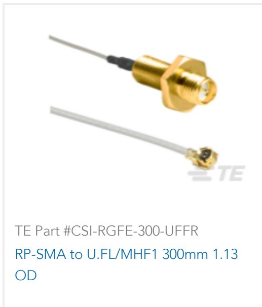
TE Part #CSI-RGFE-300-UFFR RP-SMA to U.FL/MHF1 300mm 1.13 OD