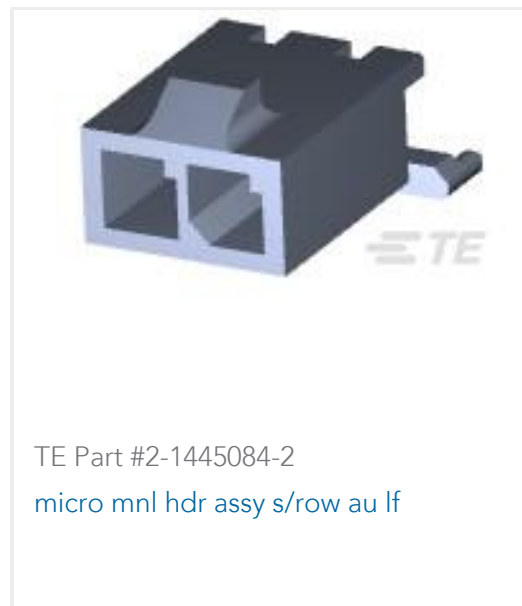
TE Part #2-1445084-2 micro mnl hdr assy s/row au lf