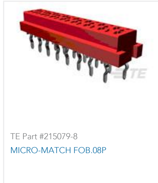
TE Part #215079-8 MICRO-MATCH FOB.08P