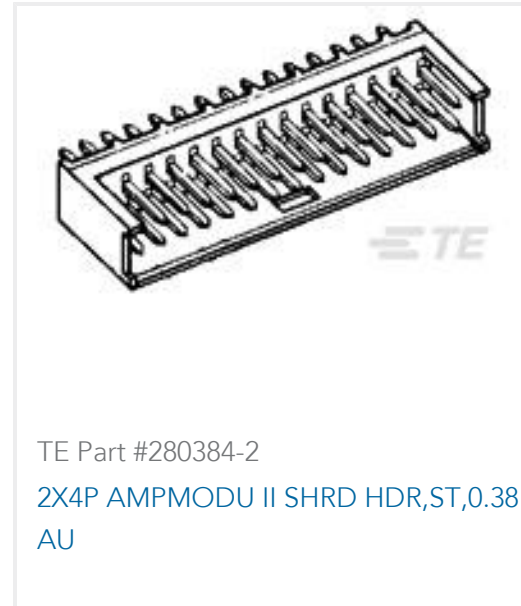
TE Part #280384-2 2X4P AMPMODU II SHRD HDR,ST,0.38 AU