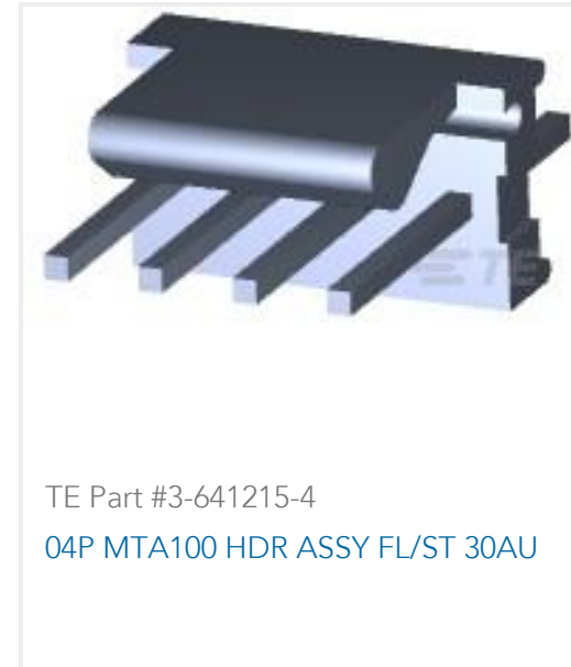
TE Part #3-641215-4 04P MTA100 HDR ASSY FL/ST 30AU