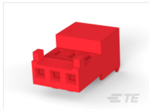
TE Part # CAT-104MTA-NTPMR Nylon Tin Plated Receptacle: 2.54 mm, with Mating Alignment, MTA 100