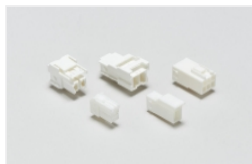
Rectangular Power Connectors(1)