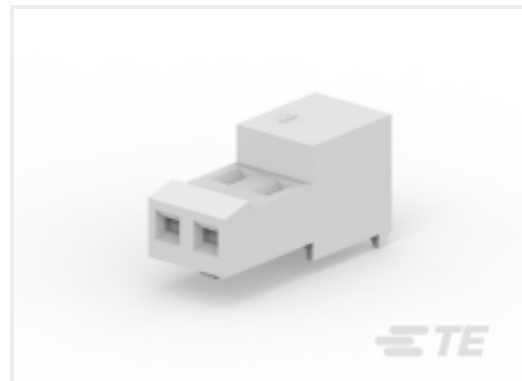
TE Part # CAT-104MTA-NTPNR MTA Receptacle: Nylon, Tin Plated, 2.54 mm