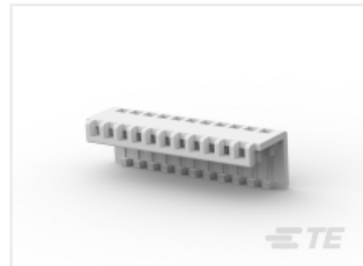
TE Part # CAT-104MTA-NYLCC Nylon PCB Connector Covers: 2.54 mm, MTA 100