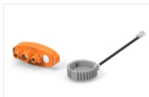
Connector Caps & Covers(69)