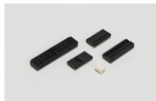
Wire-to-Board Connector Assemblies & Housings(457)