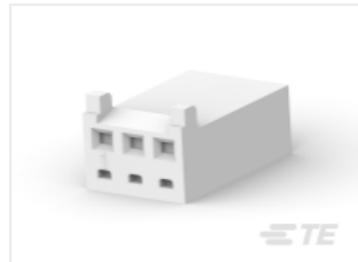
TE Part # 1375820-3 CST-100 II HOUSING 3 POS