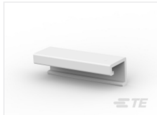
TE Part # CAT-104MTA-PLSCC Polyester PCB Connector Covers: 2.54 mm, MTA 100