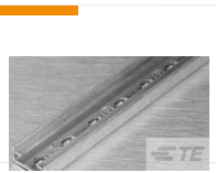
12=MIN CHANNEL PACKAGED