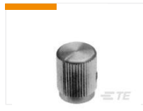
KLN900B1/4=KNOB KNURL W/IND LI