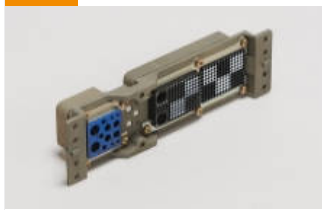
ARINC Optical Termini (2)