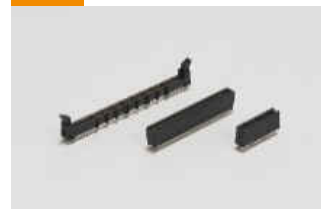
Card Edge Power Connectors (1)