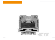
TUBULAR CLAMP, MD FLATBASE, NEMA