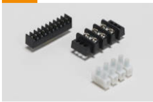
Barrier Strips (14)