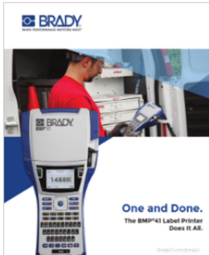
Download the BMP41 Label Printer Brochure