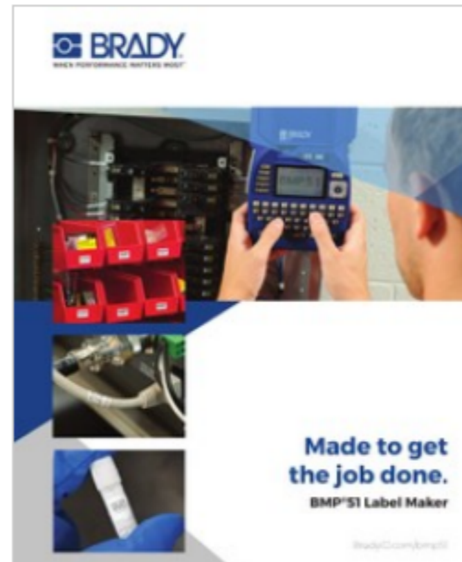
BMP51 Label Printer Brochure