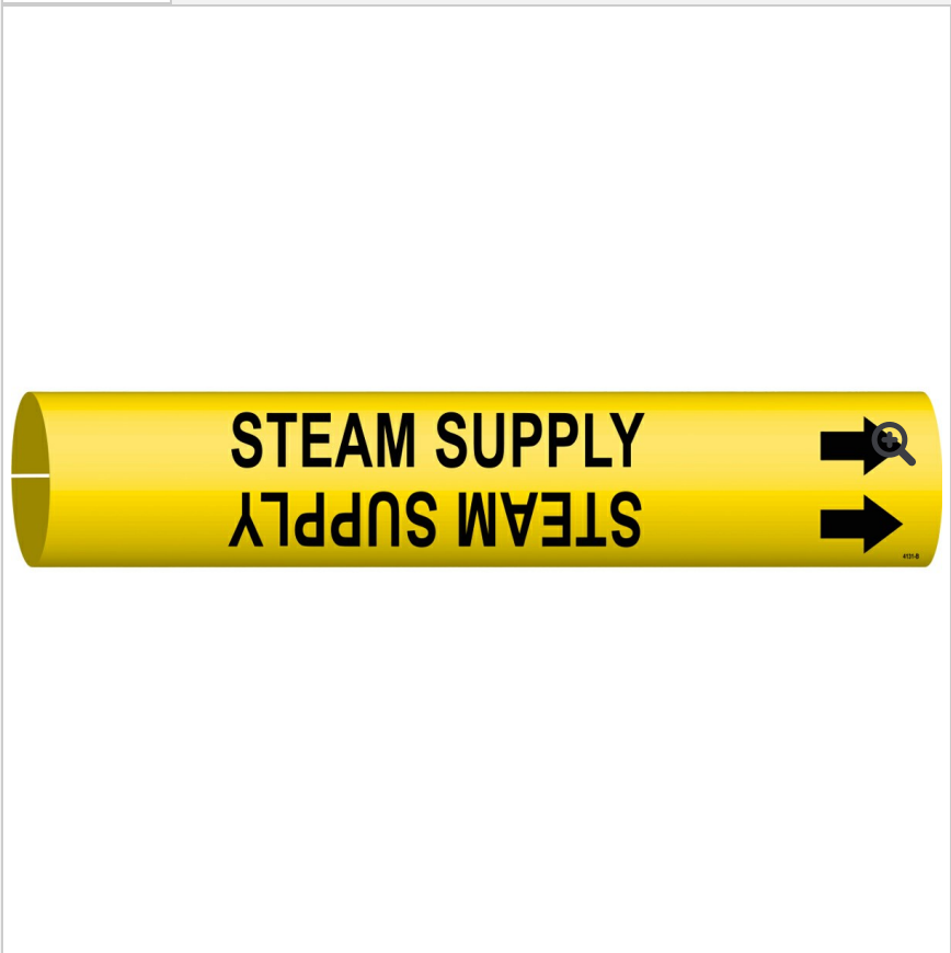
Steam Supply Pipe Marker