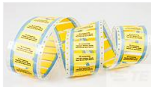
TE Part #6315830001 TMS-SCE-3/4-2.0-4