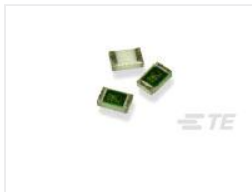
TE Part #9-1614964-2 CPF 1206 2K7 0.1% 25PPM 1K RL