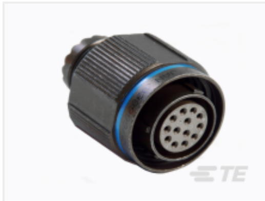
TE Part # CAT-D38999-DTS24U D38999: Straight Plug, 25-35 Insert