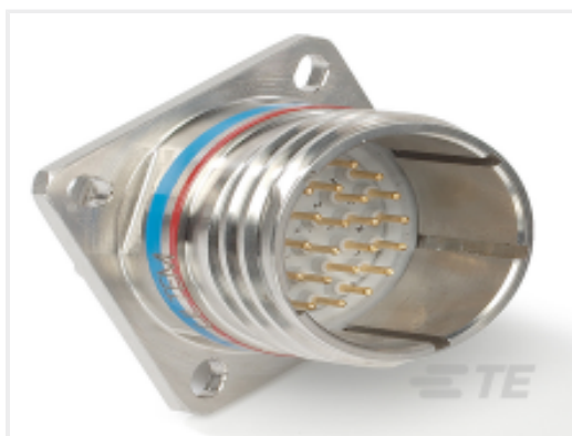
TE Part #YDTS20W19-35SBV001 RECP ASSY