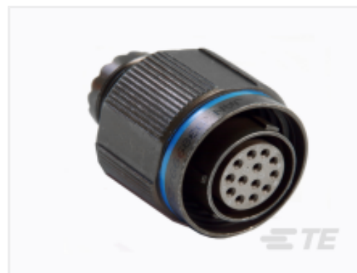
TE Part #CAT-D38999-DTS24E D38999: Straight Plug, 19-35 Insert