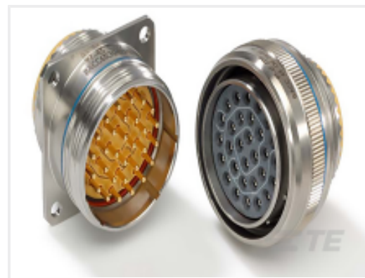
TE Part #ZPF000000000007474 983-OSE 08-03 SN