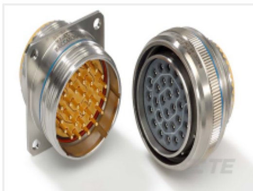
TE Part #ZPF0000000000033821 983-OSE 20-39 S7