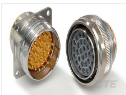
TE Part #ZPF000000000007529 983-OSE 12-03 SN