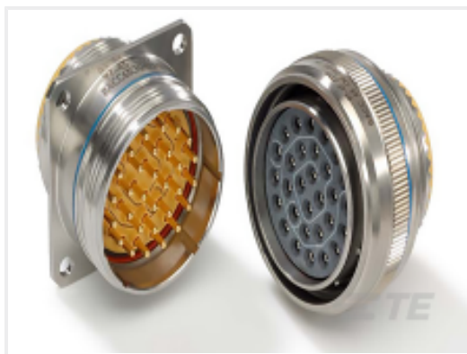
TE Part #ZPF000000000007522 983-OSE 12-03 S6