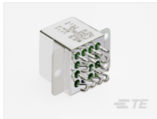
TE Part #REBC210E-1002CB REBC210E-1002CB=RELAY