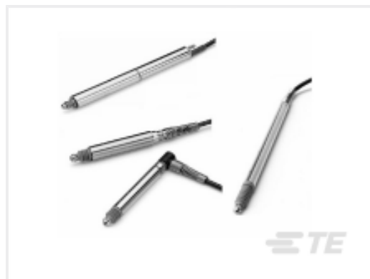
TE Part #67010010-000 CONTACT TIP #8