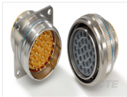
TE Part #ZPF000000000007680 983-OSE 20-39 S6