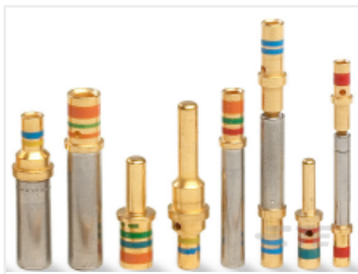
TE Part # 38941-20L CONT PIN