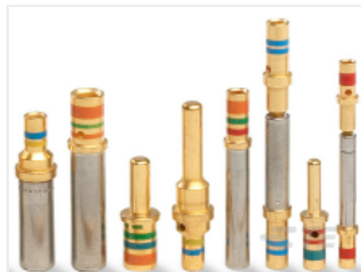
TE Part #38941-22L CONTACTS