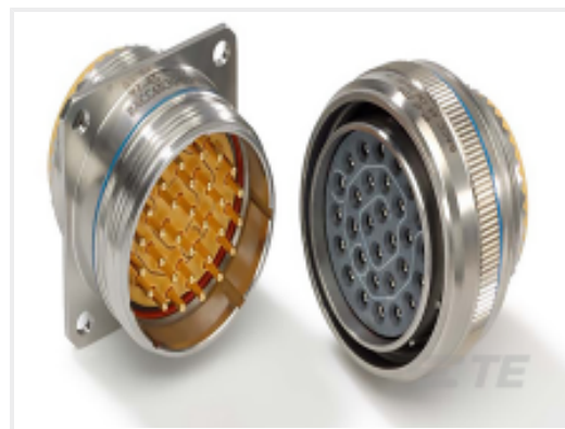
TE Part #ZPF000000000007572 983-OSE 14-07 S8