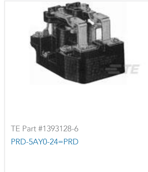
TE Part #1393128-6 PRD-5AY0-24=PRD