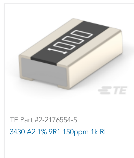
TE Part #2-2176554-5 3430 A2 1% 9R1 150ppm 1k RL