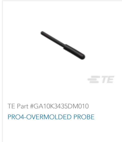
TE Part #GA10K3435DM010 PRO4-OVERMOLDED PROBE