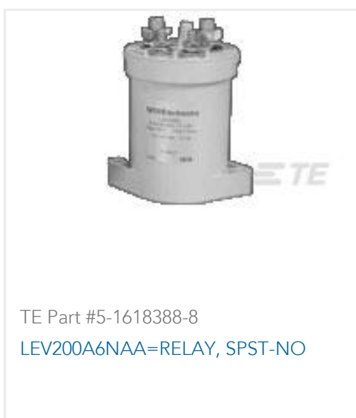
TE Part #5-1618388-8 LEV200A6NAA=RELAY, SPST-NO