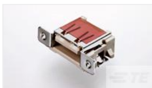
TE Part #5353928-2 Std USB Type A, R/A, SMT, Offset, Panel