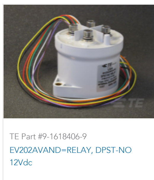
TE Part #9-1618406-9 EV202AVAND=RELAY, DPST-NO 12Vdc