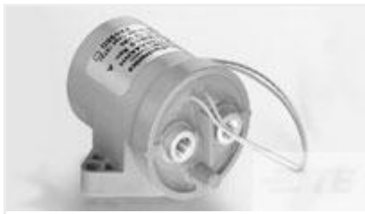
TE Part # 4-1618391-0 LEV100A4ANH=RELAY,SPST-NO, 12VDC