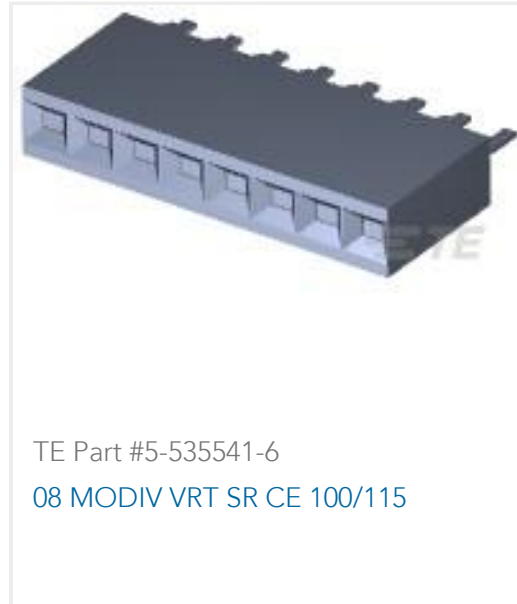
TE Part #5-535541-6 08 MODIV VRT SR CE 100/115