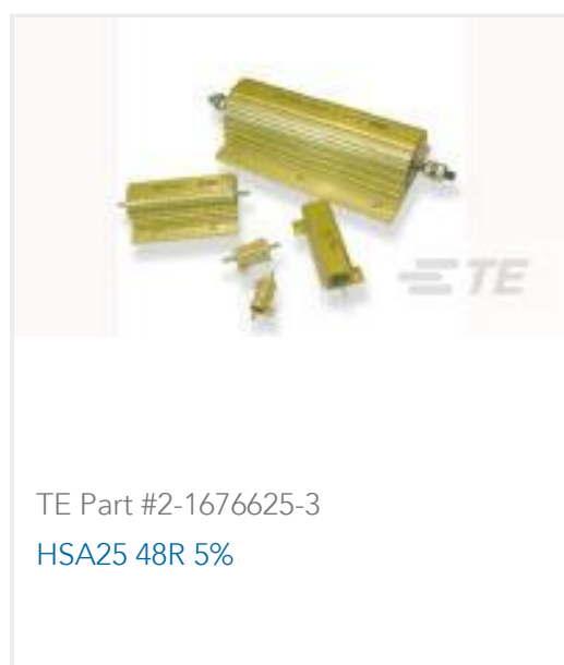
TE Part #2-1676625-3 HSA25 48R 5%