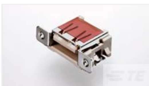
TE Part #5353928-1 Std USB Type A, R/A, SMT, Offset, Panel