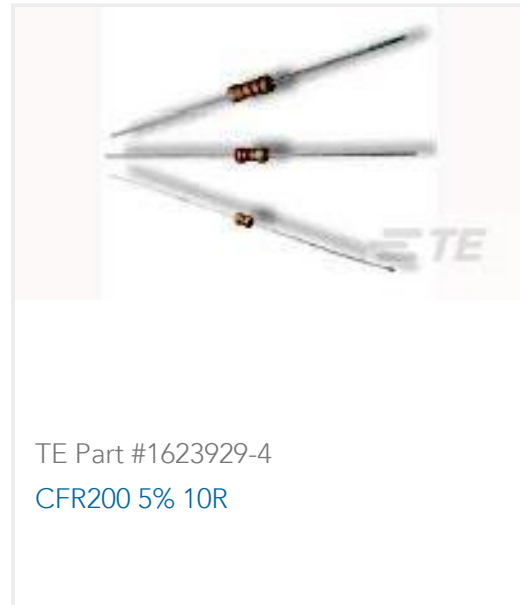
TE Part #1623929-4 CFR200 5% 10R