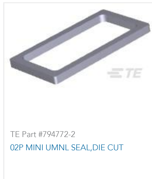
TE Part #794772-2 02P MINI UMNL SEAL, DIE CUT