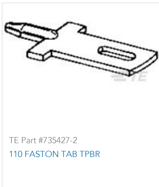
TE Part #735427-2 110 FASTON TAB TPBR