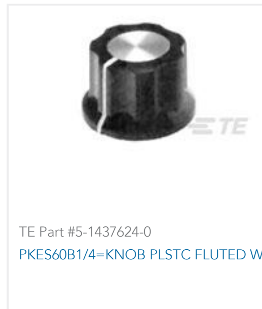
TE Part #5-1437624-0 PKES60B1/4=KNOB PLSTC FLUTED W