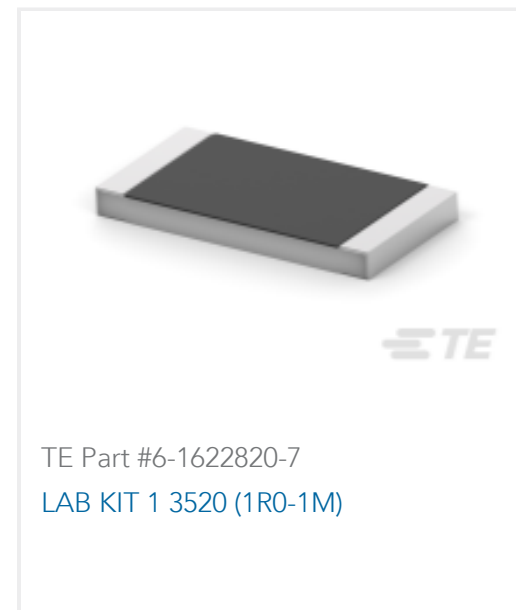
TE Part #6-1622820-7 LAB KIT 1 3520 (1R0-1M)