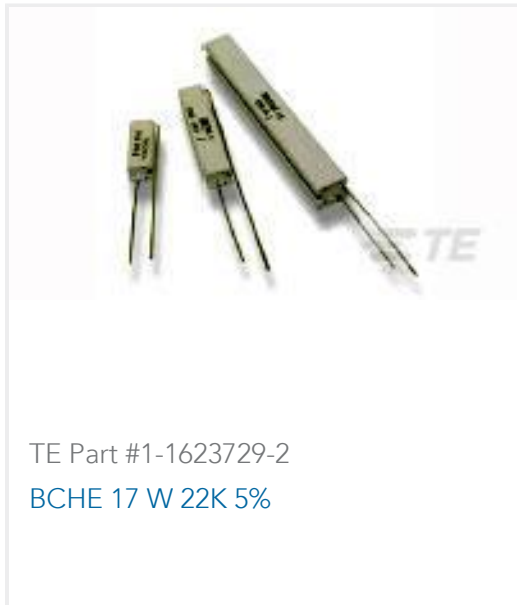
TE Part #1-1623729-2 BCHE 17 W 22K 5%