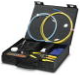
Tool set for GOF assembly

Tool set - FOC-TOOL-GOF KONF SET - 1411049