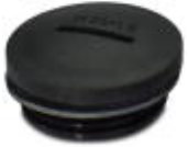
Filler plug, plastic, size: M25