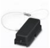
Protective cover D15, for single locking latch, protective cover material: PA, height: 20.5 mm, seal: yes

Protective covers - HC-D15-BCSFS-PRBK - 1414641