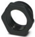
Reducing adapter, material: Polyamide fiberglass reinforced, connecting thread: M25 x 1.5, color: black, with flat gasket

Reducing adapter - REDUC-K-KV-M25/M20 BK - 1411232