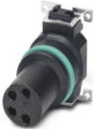
Flush-type connector, 4-position, Socket, Link: straight, Link: M8, A-coded, PCB mounting

Please be informed that the data shown in this PDF Document is generated from our Online Catalog. Please find the complete data in the user's documentation. Our General Terms of Use for Downloads are valid ( http://phoenixcontact.com/download )