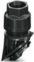
EVO plastic cable gland with bayonet locking; size M40, with filler plug

Please be informed that the data shown in this PDF Document is generated from our Online Catalog. Please find the complete data in the user's documentation. Our General Terms of Use for Downloads are valid ( http://phoenixcontact.com/download )