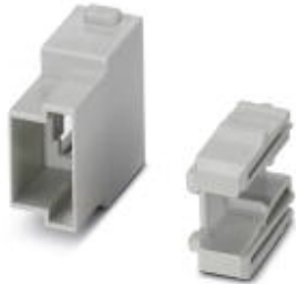
Contact insert module, Pin, Application: Data, Adapter for patch cables

Please be informed that the data shown in this PDF Document is generated from our Online Catalog. Please find the complete data in the user's documentation. Our General Terms of Use for Downloads are valid ( http://phoenixcontact.com/download )