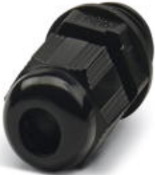
Cable gland, Cable gland material: PA, External cable diameter 4 mm ... 8 mm, Shielding: No, Connecting thread: M16

Please be informed that the data shown in this PDF Document is generated from our Online Catalog. Please find the complete data in the user's documentation. Our General Terms of Use for Downloads are valid ( http://phoenixcontact.com/download )