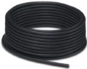
Cable reel, 17-position, PVC, black RAL 9005, free cable end, on free cable end, cable length: 100 m

Please be informed that the data shown in this PDF Document is generated from our Online Catalog. Please find the complete data in the user's documentation. Our General Terms of Use for Downloads are valid ( http://phoenixcontact.com/download )