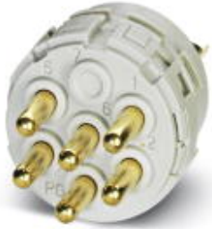
Contact insert, number of positions: 7, type of contact: Pin, Solder connection

Please be informed that the data shown in this PDF Document is generated from our Online Catalog. Please find the complete data in the user's documentation. Our General Terms of Use for Downloads are valid ( http://phoenixcontact.com/download )