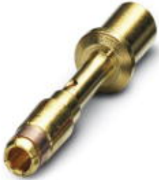
Crimp contact, turned, Single contact, contact diameter: 2 mm, crimp range: 0.25 mm 2 ... 1 mm 2

Please be informed that the data shown in this PDF Document is generated from our Online Catalog. Please find the complete data in the user's documentation. Our General Terms of Use for Downloads are valid ( http://phoenixcontact.com/download )