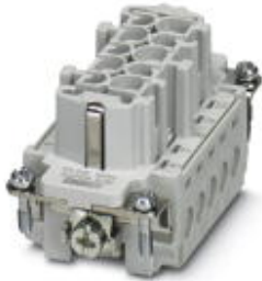
HEAVYCON female insert, B10 series, 10-pos., screw connection

Please be informed that the data shown in this PDF Document is generated from our Online Catalog. Please find the complete data in the user's documentation. Our General Terms of Use for Downloads are valid ( http://phoenixcontact.com/download )