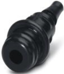
Pneumatic pin, for HC-M-PN3 module, internal hose diameter of 3.0 mm

Please be informed that the data shown in this PDF Document is generated from our Online Catalog. Please find the complete data in the user's documentation. Our General Terms of Use for Downloads are valid ( http://phoenixcontact.com/download )