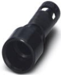
Pneumatic socket, for HC-M-PN3 module, internal hose diameter of 1.6 mm

Please be informed that the data shown in this PDF Document is generated from our Online Catalog. Please find the complete data in the user's documentation. Our General Terms of Use for Downloads are valid ( http://phoenixcontact.com/download )