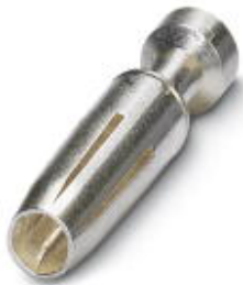
Turned 2.5 crimp contact, individual female contact, core diameter 3.00 mm 2 , silver-plated

Please be informed that the data shown in this PDF Document is generated from our Online Catalog. Please find the complete data in the user's documentation. Our General Terms of Use for Downloads are valid ( http://phoenixcontact.com/download )