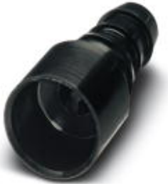
Pneumatic socket, for HC-M-PN2 module, internal hose diameter of 6.0 mm

Please be informed that the data shown in this PDF Document is generated from our Online Catalog. Please find the complete data in the user's documentation. Our General Terms of Use for Downloads are valid ( http://phoenixcontact.com/download )