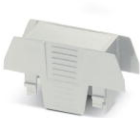
Component housing, connection opening on both sides, Upper part, color: gray, width: 22.5 mm

Please be informed that the data shown in this PDF Document is generated from our Online Catalog. Please find the complete data in the user's documentation. Our General Terms of Use for Downloads are valid ( http://phoenixcontact.com/download )