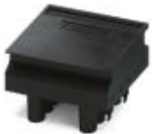
Power bridge, for VersaPoint power-level modules

Power bridge - GE-IB IL 400 CN-BRG - 2742968