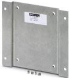
Mounting plate for SFNT switches

Please be informed that the data shown in this PDF Document is generated from our Online Catalog. Please find the complete data in the user's documentation. Our General Terms of Use for Downloads are valid ( http://phoenixcontact.com/download )