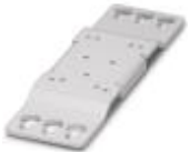
Universal wall adapter for securely mounting the device in the event of strong vibrations. The device is screwed directly onto the mounting surface. The universal wall adapter is attached on the top/bottom.

Assembly adapters - UWA 182/52 - 2938235