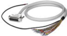
The figure shows the 25-pos. vertical entry version

Shielded cable with a 37-pos. D-SUB female connector with a 45-degree hood and one open end. Individual wires are labeled 1 to 37 and fitted with ferrules. The braided shield is routed to a separate cable end. Cable length: 1 m.