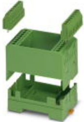
Electronic housing set, consisting of electronic module and printed circuit termination blocks, pitch 5

Please be informed that the data shown in this PDF Document is generated from our Online Catalog. Please find the complete data in the user's documentation. Our General Terms of Use for Downloads are valid ( http://phoenixcontact.com/download )