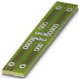
PCB for assembling electronic components

Please be informed that the data shown in this PDF Document is generated from our Online Catalog. Please find the complete data in the user's documentation. Our General Terms of Use for Downloads are valid ( http://phoenixcontact.com/download )