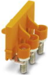
Switching jumper, pitch: 8.2 mm, width: 23.5 mm, number of positions: 3, color: orange

Please be informed that the data shown in this PDF Document is generated from our Online Catalog. Please find the complete data in the user's documentation. Our General Terms of Use for Downloads are valid ( http://phoenixcontact.com/download )