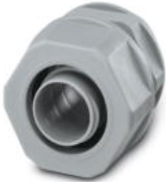
Cable gland made from PP with metric thread, IP65 protection

Please be informed that the data shown in this PDF Document is generated from our Online Catalog. Please find the complete data in the user's documentation. Our General Terms of Use for Downloads are valid ( http://phoenixcontact.com/download )