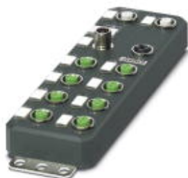
Axioline E-EtherCAT ® device in a plastic housing with 8 digital inputs and 8 digital outputs, 24 V DC, M12 fast connection technology

Please be informed that the data shown in this PDF Document is generated from our Online Catalog. Please find the complete data in the user's documentation. Our General Terms of Use for Downloads are valid ( http://phoenixcontact.com/download )