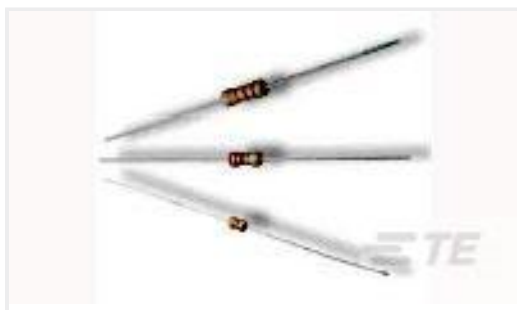
TE Part #3-1623932-1 CFR50 5% 180R