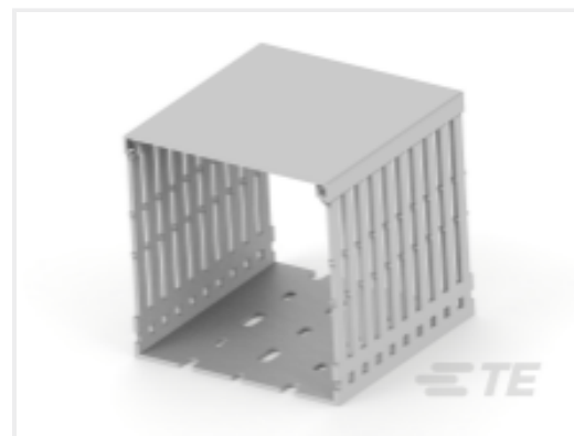
TE Part #CAT-Z62-W1-DP PVC Wiring Duct: 2 meters, Gray Color, Flame-Retardant