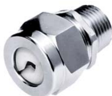
Machined Zinc-Plated Steel